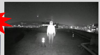
IR Camera (Full HD, 30fps)