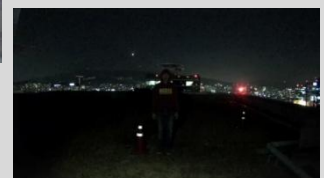
Normal Camera (Full HD, 30fps)