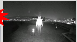
IR Camera (Full HD, 30fps)