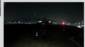
Normal Camera (Full HD, 30fps)