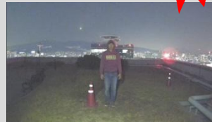
Dark Hunter (HD, 60fps)