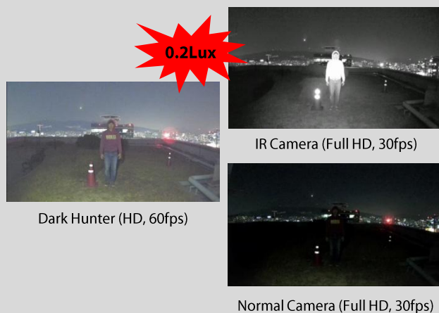
Dark Hunter (HD, 60fps)